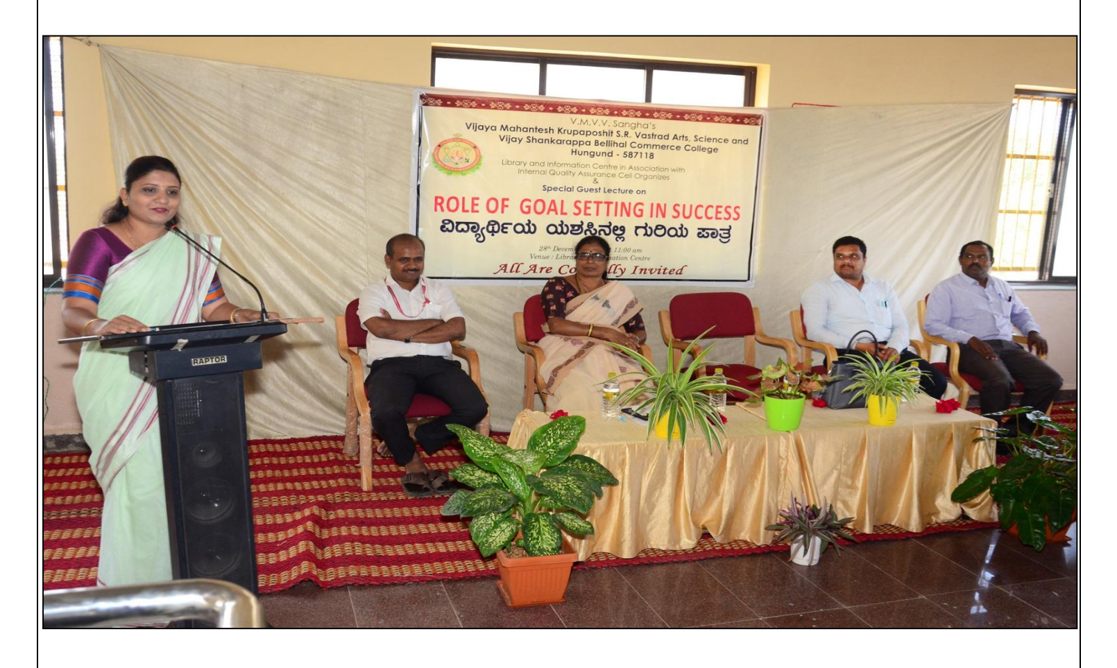
The principal addressed the gathering