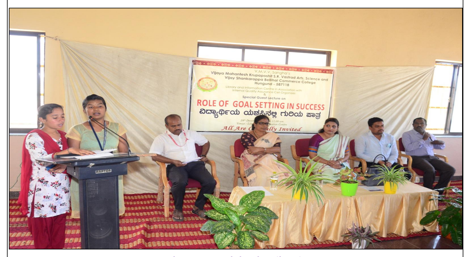
Welcome speech by the Librarian