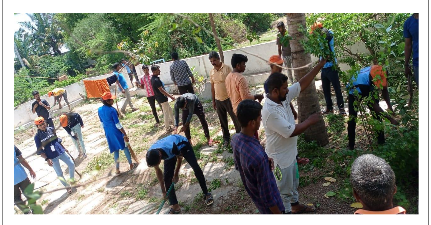
"Swacchata Abhiyan" at Amaravati Village by NSS unit