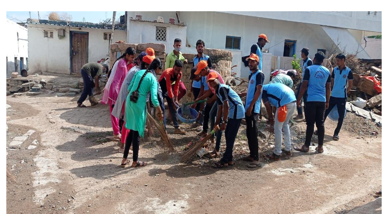
"Swacchata Abhiyan" at Amaravati Village by NSS unit