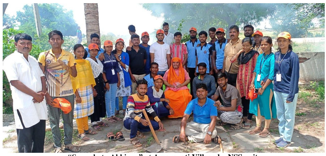
"Swacchata Abhiyan" at Amaravati Village by NSS unit