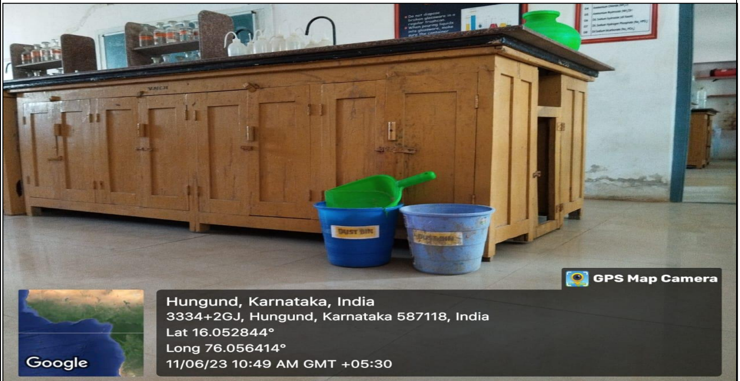
Dustbins placed in the Library.

Hungund, Karnataka, India 3334+2GJ, Hungund, Karnataka 587118, India Lat 16.052844° Long 76.056414° 11/06/23 10:45 AM GMT +05:30