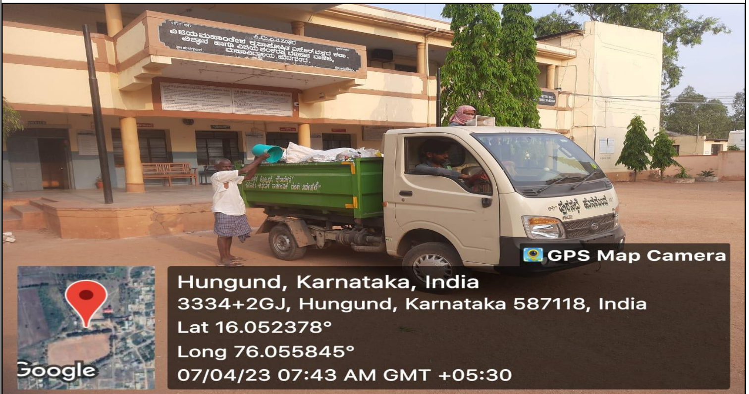
CAPTION: Glass, Plastic and Organic waste is segregated in the campus.

Hungund, Karnataka, India 3334+2GJ, Hungund, Karnataka 587118, India Lat 16.052844° Long 76.056414° 11/06/23 10:20 AM GMT +05:30