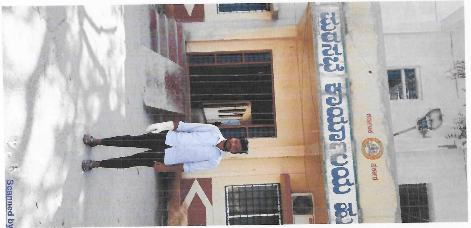
Scanned by Scanner Go