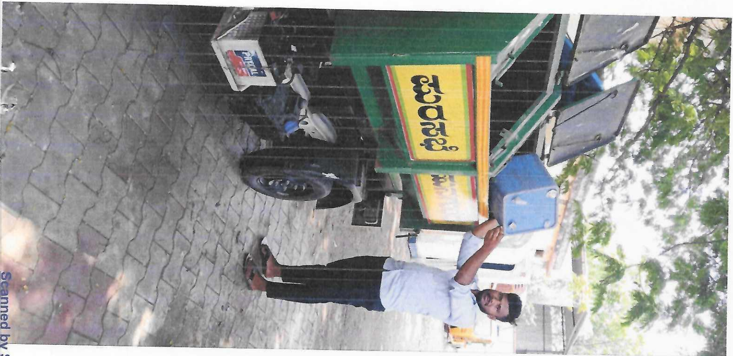
Scanned by Scanner Go