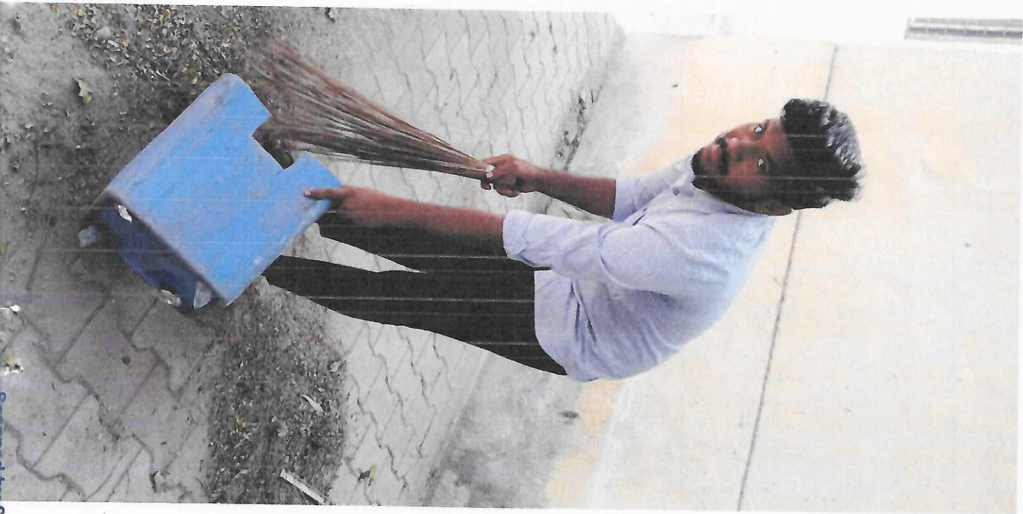
Scanned by Scanner Go