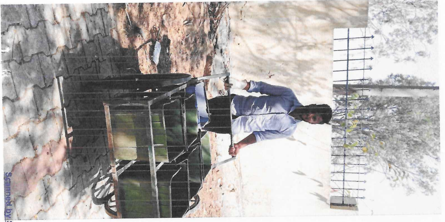
Scanned by Scanner Go