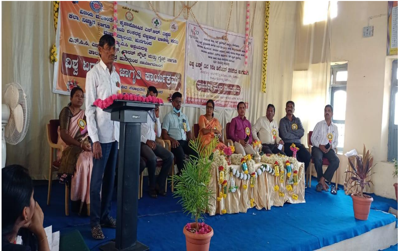
HIV-AIDS Awareness Day by NSS unit-2021