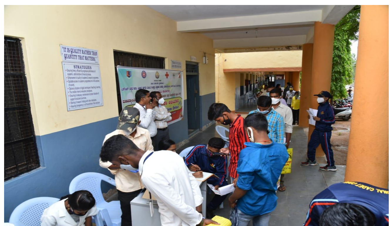
COVID-19 Vaccination Drive-2021