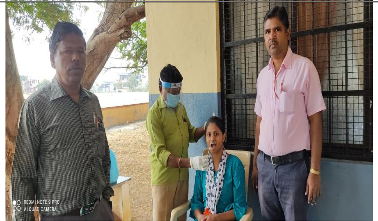
COVID-19 Vaccination Drive in Association with Taluka Govt Hospital During 2021