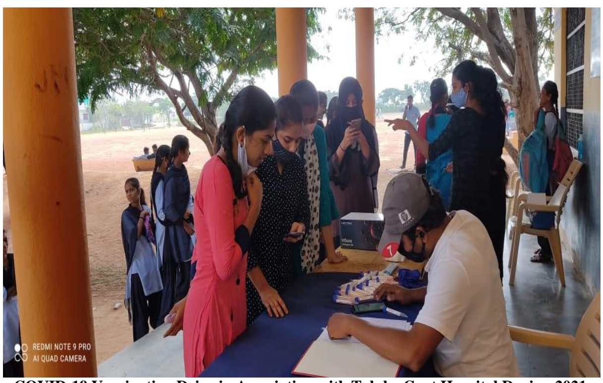
COVID-19 Vaccination Drive in Association with Taluka Govt Hospital During 2021