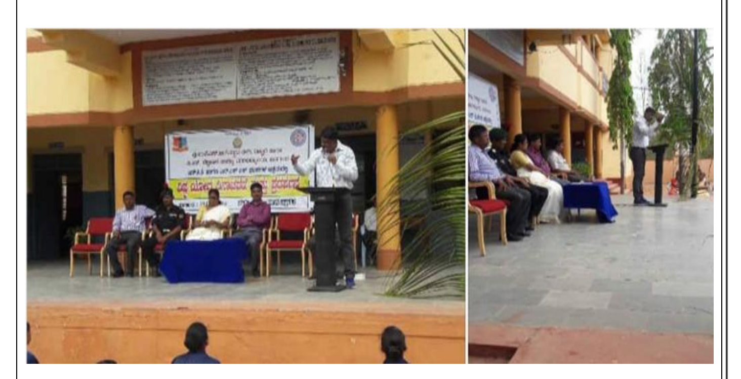
International Yoga Day during 2019-20