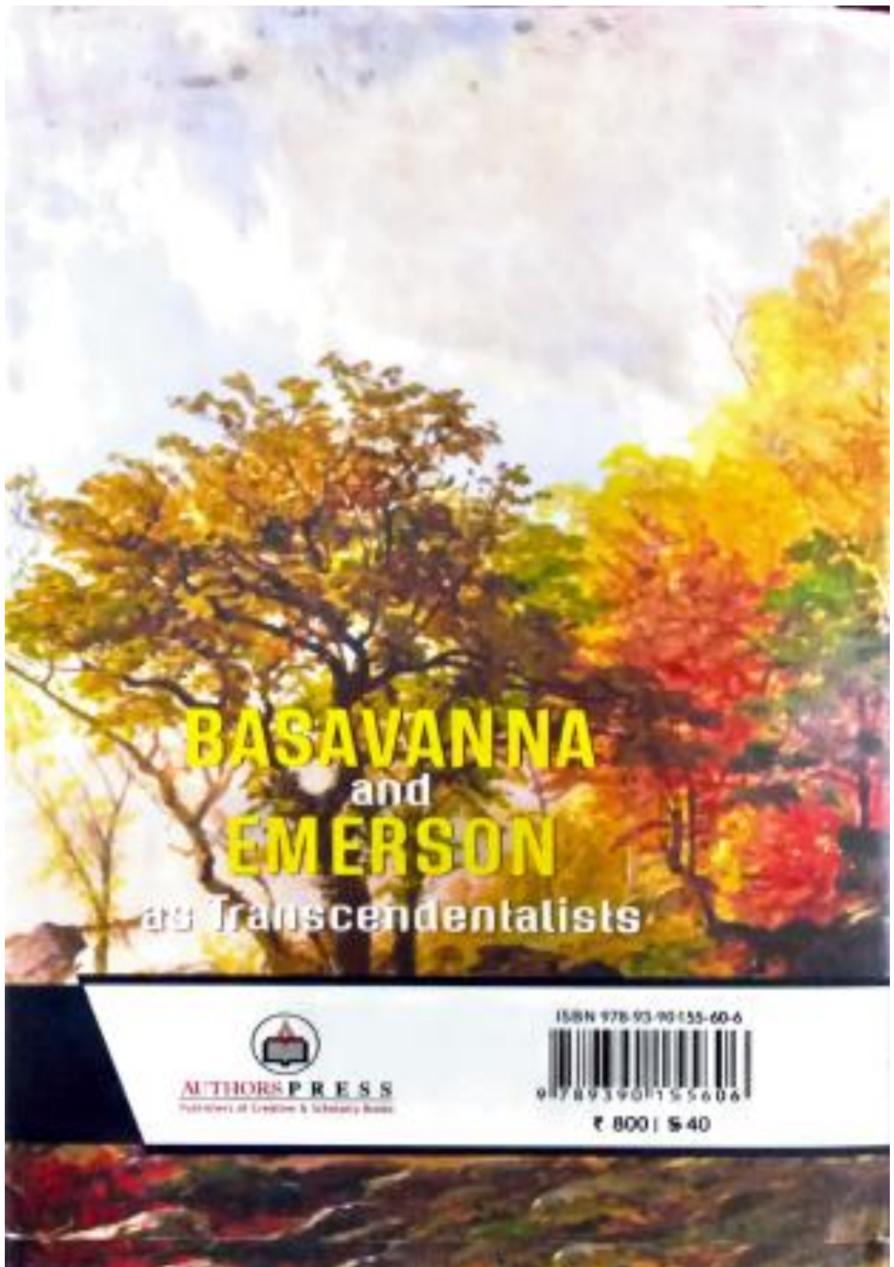
Back Cover Page of the Book