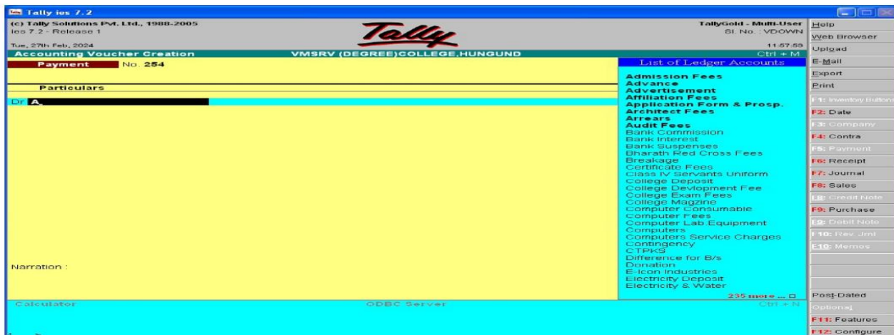
List of vouchers