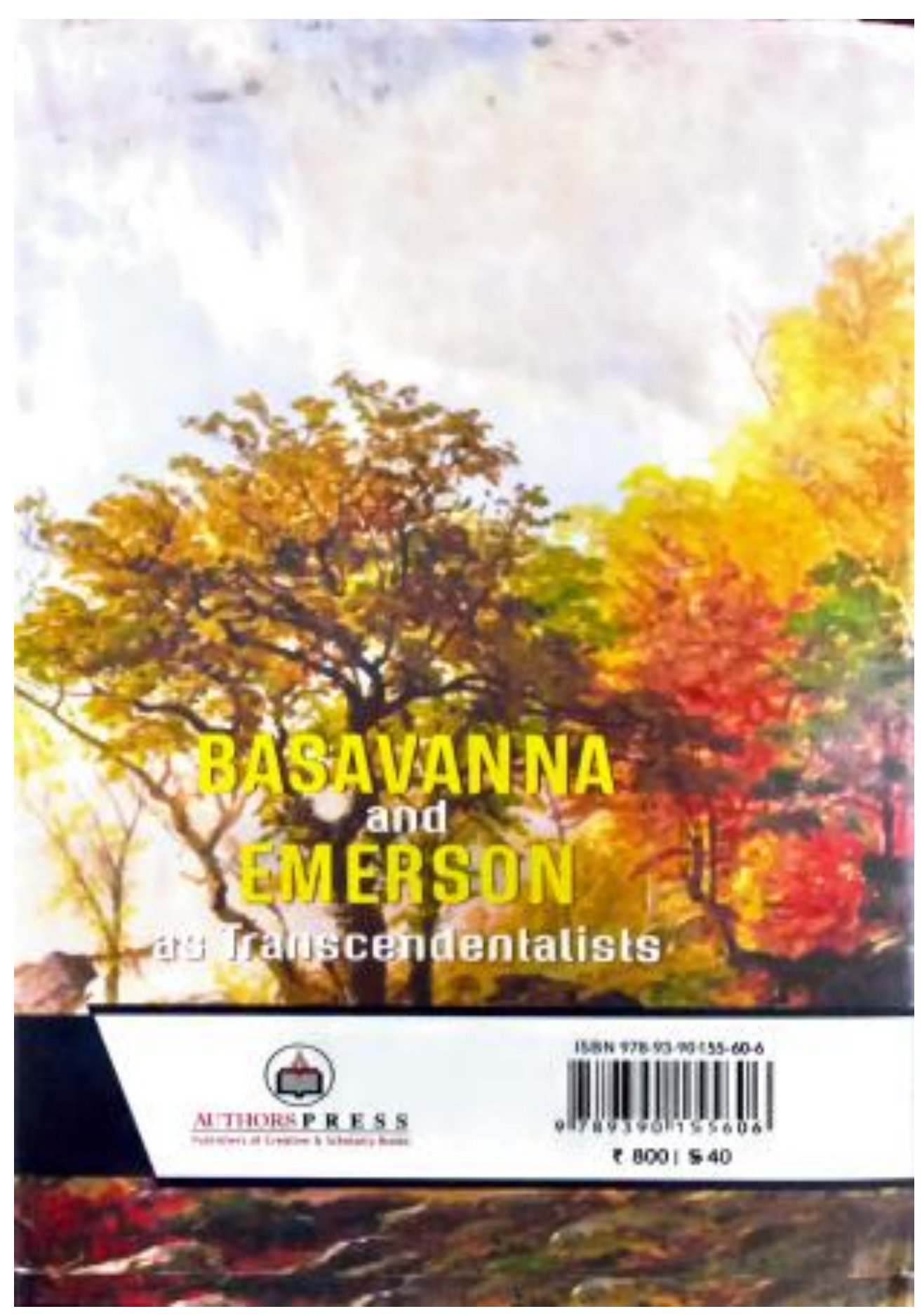
Back Cover Page of the Book