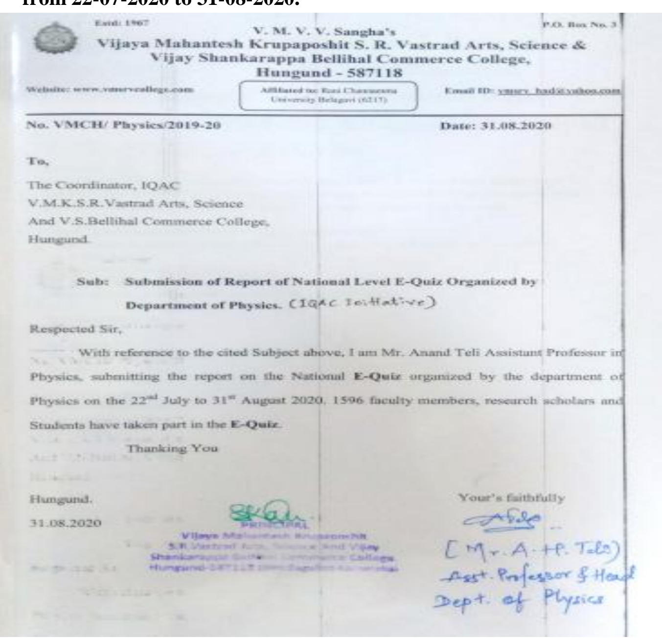
Report of the e-Quiz