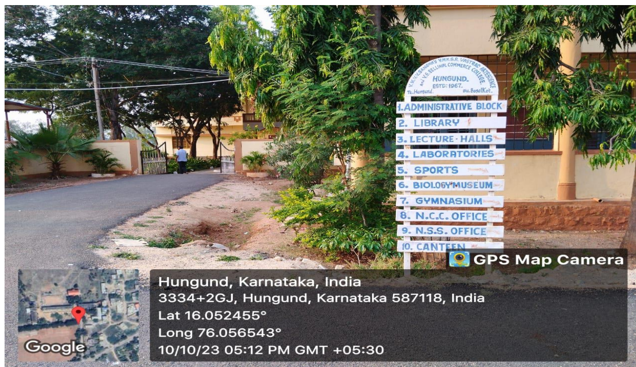
08. Sign board for directions