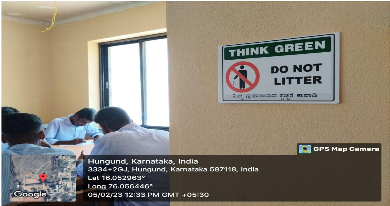
21. Sign board on 'Do Not Litter'