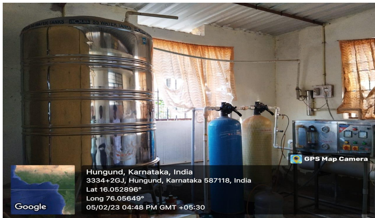
19. The RO water plant in the college