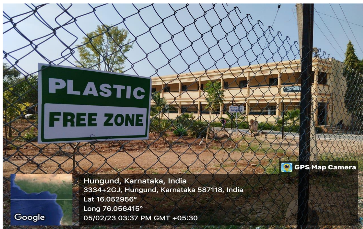
20. Sign board 'Plastic Free Zone'