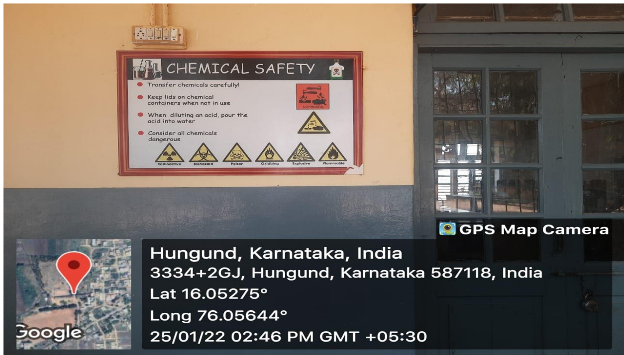
06. Sign board on 'chemical safety'