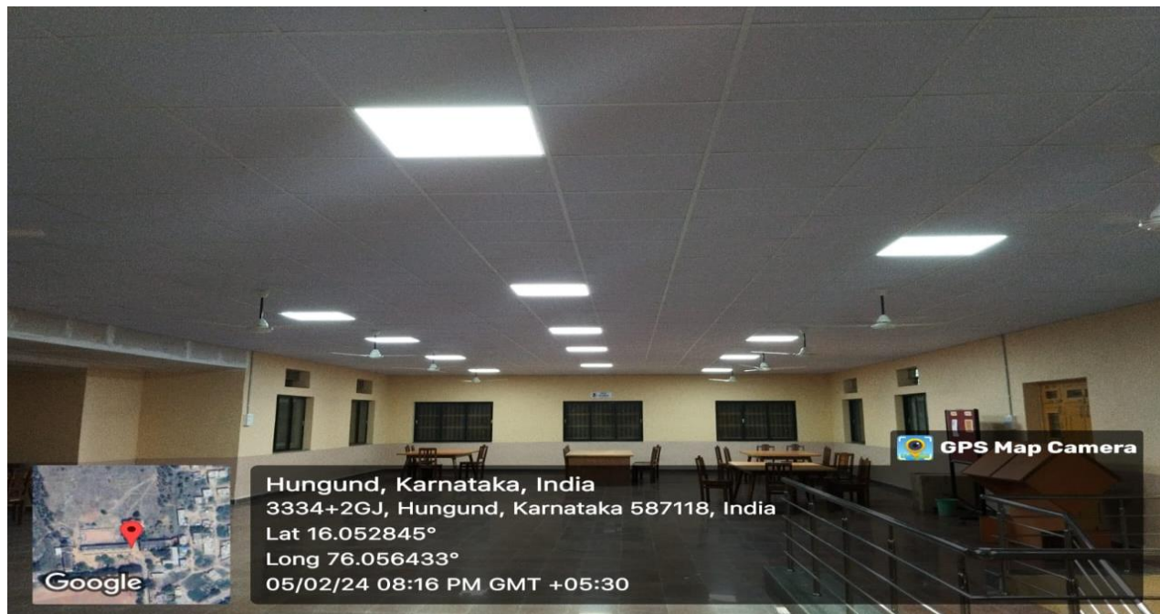
07. LED bulbs in the Library's reading hall