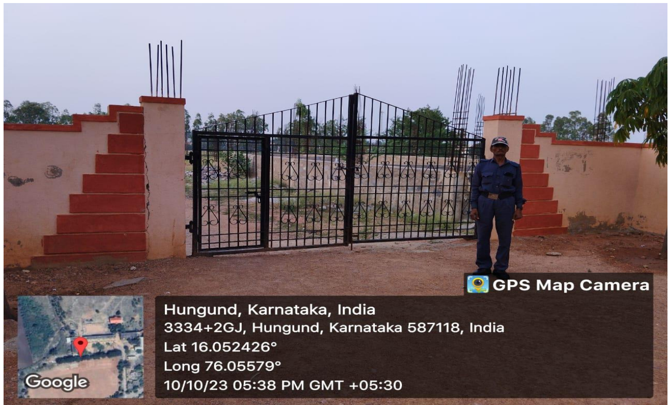
22. Security guard